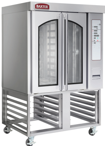
Shown with optional 12 pan stand